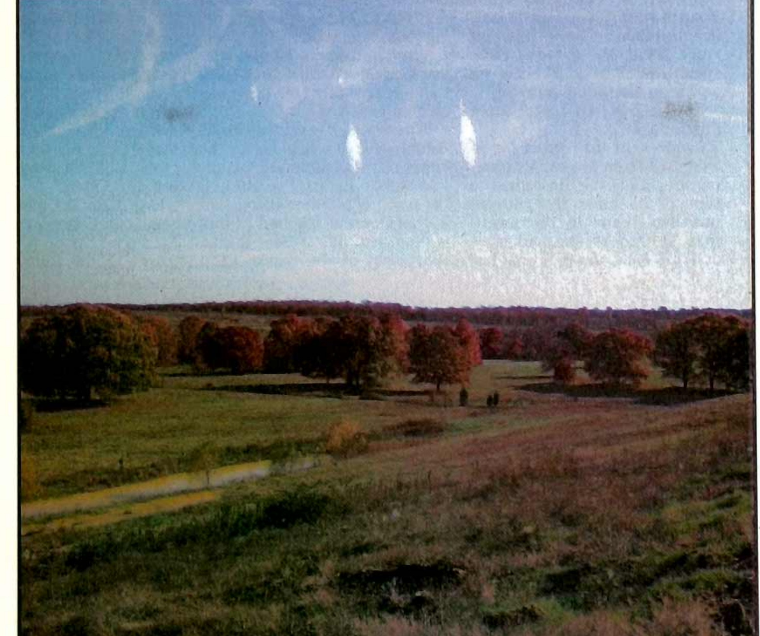
Hundreds of acres of city-owned land that sits between two ridges and is adjacent to the Sallisaw Landfill may be the home of a coal-fired power plant if Tenaska Inc. decides to go through with the purchase of the 950 acres. The company signed a purchase option agreement with the city for the land in September.

But ."This is definitely our preferred site," he said.