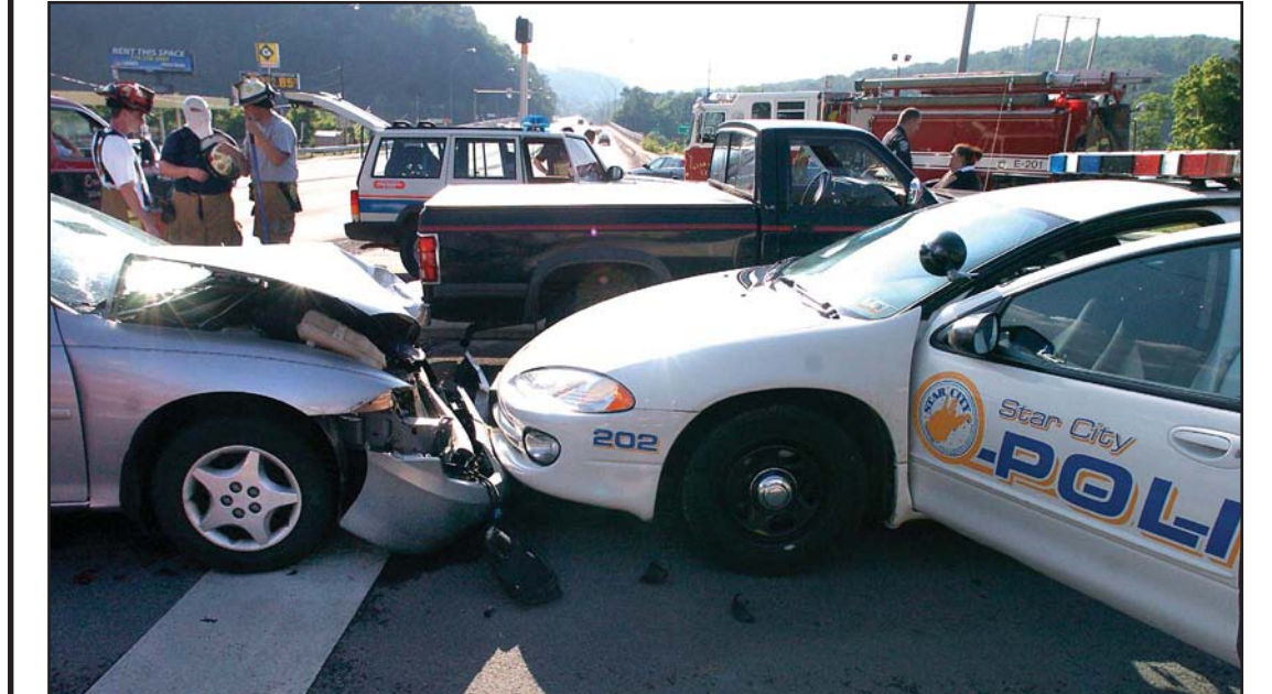
Police officers and firefighters respond to the intersection of Mon Boulevard and Boyers Avenue.