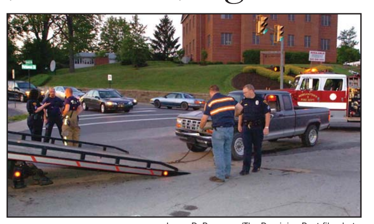
An accident at the intersection of Patteson Drive and University Avenue.

About three times a week, a MECCA 911 emergency dispatcher will answer a call about a motor vehicle accident at the intersection of Monongahela Boulevard and Patteson Drive. In the first 30 weeks of this year, 91 crashes have been reported at that intersection. According to numbers from the Monongalia County office of Emergency Management (OEM), Monongahela Boulevard, W.Va. Highway 705 and Grafton Road are the top three